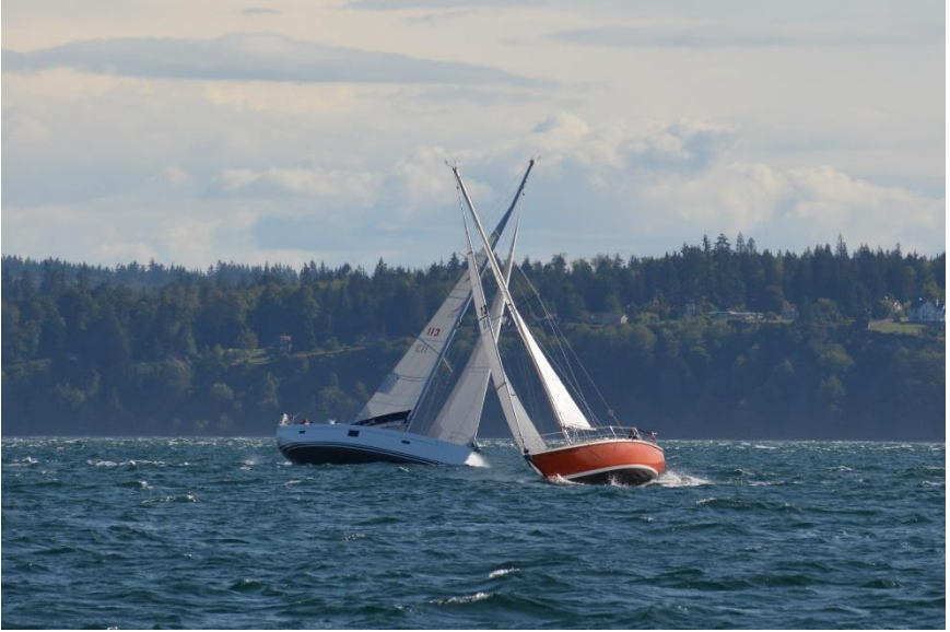
First annual Ludlow Double Dipper in 2019