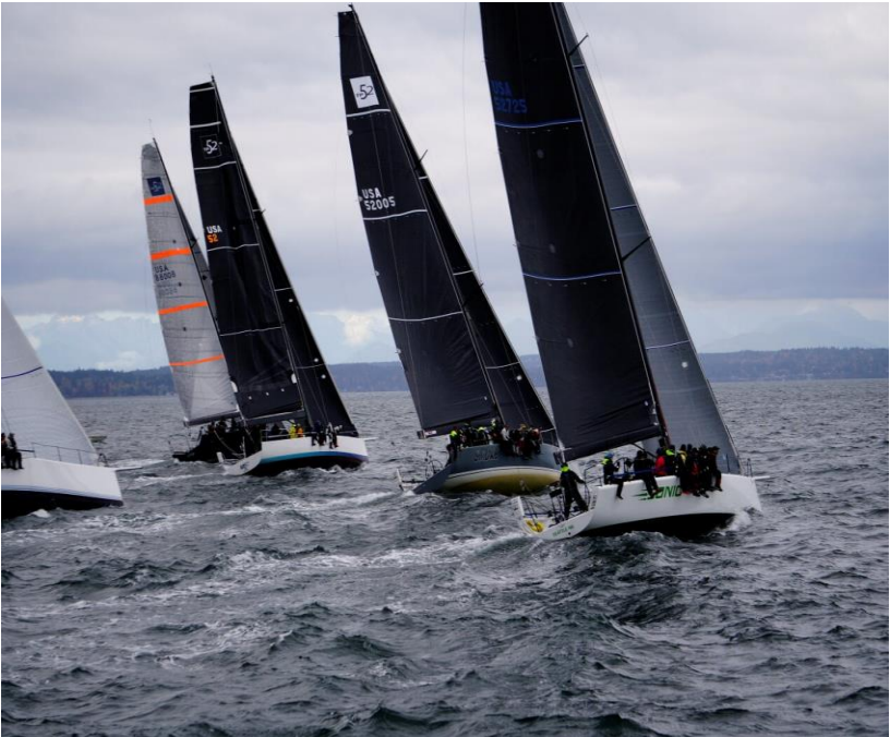
ORC start at Grand Prix Regatta