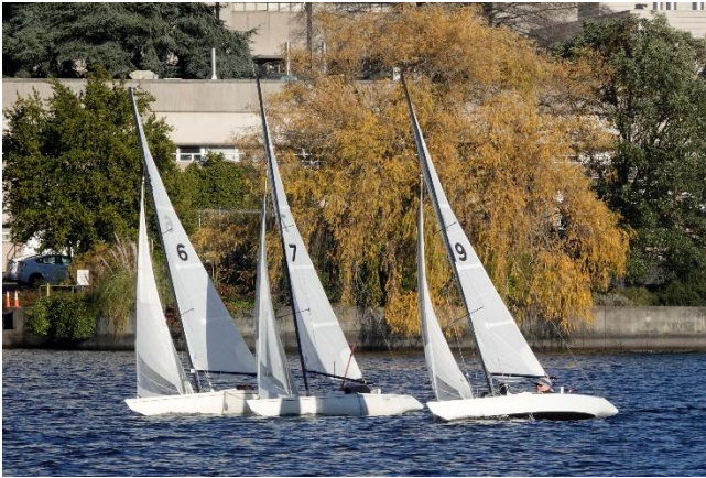
Mini-12's rail-to-rail racing on Portage Bay!

Every year we have seven series consisting of five regattas each. And with our friends at Royal Victoria Yacht Club and their ten boats, our two clubs alternate as host for an annual Inter-Club Team Race Regatta.