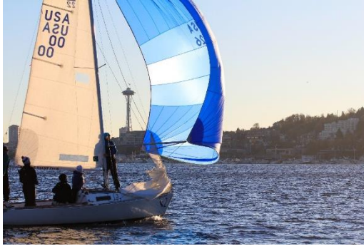
J/22 on Lake Union