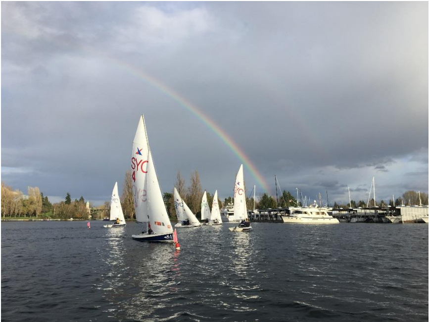
Vanguard 15's on Portage Bay