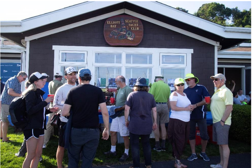
Annual Tri-Island Series Party at the Elliott Bay Marina clubhouse, following the Blake Island Race.