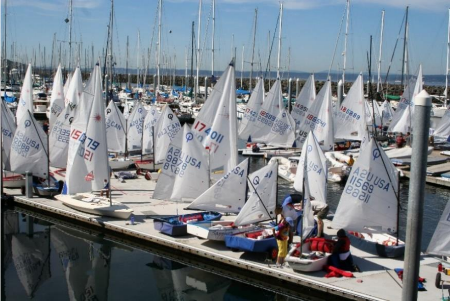
Seattle Yacht Club hosts the annual PNW Junior Olympics Regatta.