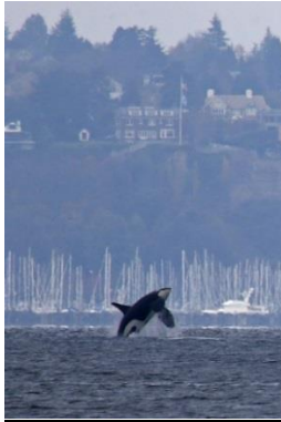
Save the Orcas