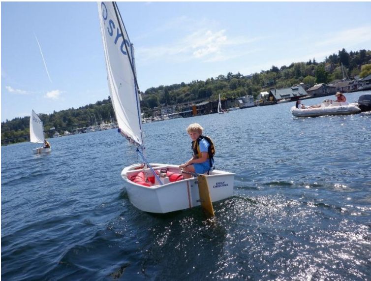
Opti sailing in Portage Bay

This year's program will run from June 15 to September 4. Classes run from 9:00 AM - 4:00 PM, Monday through Friday. Students can sign up for a week at a time, and for multiple weeks during the summer!!