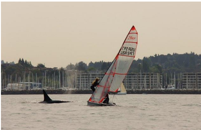
Sailors at Jr. Olympics avoid feeding the Orcas!