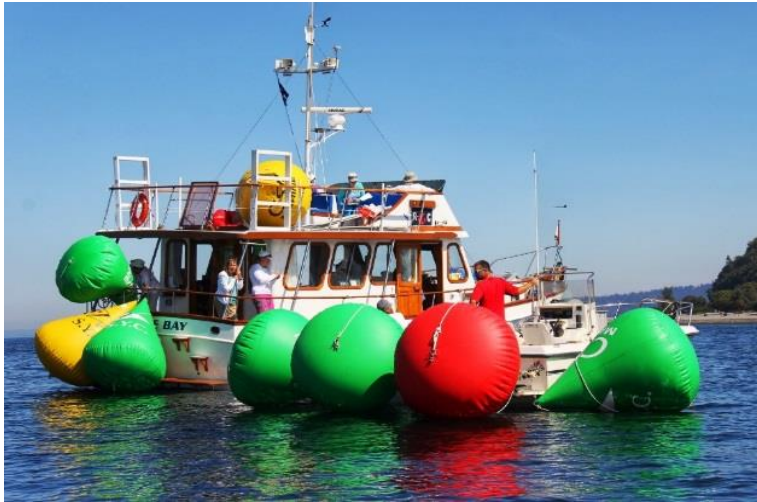
Race Committee Boat - Portage Bay